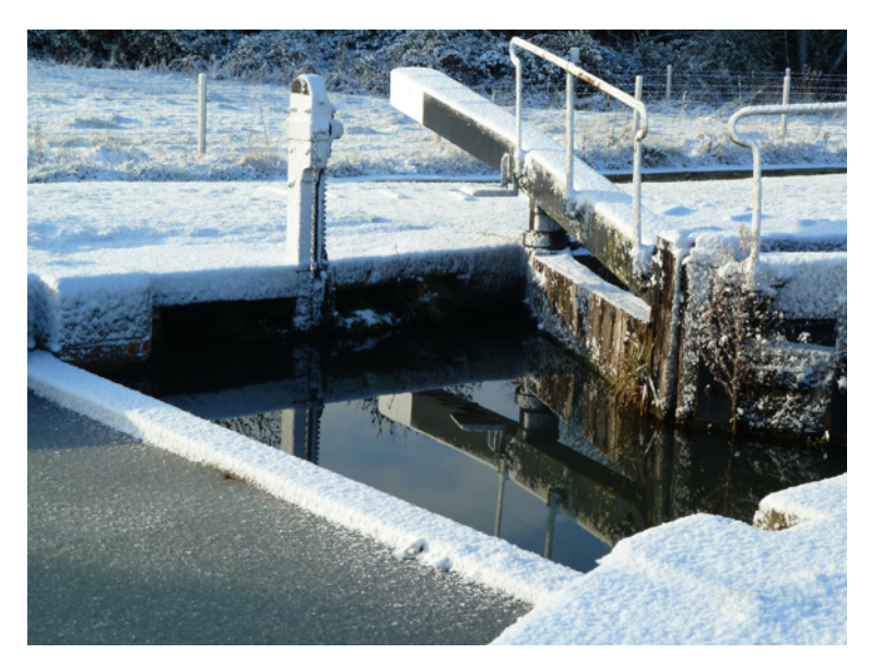
It's too late to wish you all a Happy Christmas but best wishes for a very Happy, Healthy and Prosperous New Year from all of us at GCS.