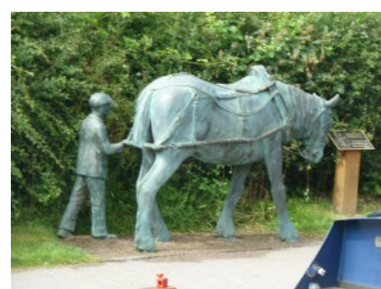
Is it copper? No it's fibreglass. Top of Foxton Locks