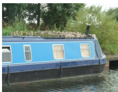
Oh! to be tidy!