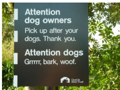
At least someone in the Canal & River Trust has a sense of humour

During a recent trip from Long Eaton to Foxton Locks and back I looked out for some interesting sights. Ed