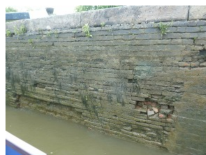
Don't think we should worry too much about our brickwork.