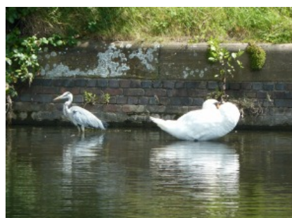
"Lets just pretend we hadn't noticed each other"