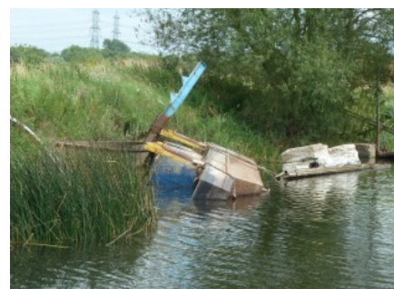
Not the way to look after a dredger!