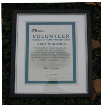
The Award. (Left).