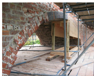
Denton Bridge under repair at last

10. Working Party: Once again the WRG Bit-in-the-Middle Team (BITM) generously gave their time to the Grantham Canal. During the weekend of 21st / 22nd November they were working with our team between Mann's Bridge and Hollygate Lane. The work involved the removal of vegetation, overhanging trees and the construction of wildlife habitats. 9 GCS members signed in, as did 14 of our friends from BITM. Photos in Dec edition.