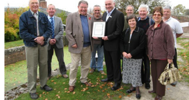
Representatives from BW and GCS at the presentation. (Right).

10. Working Party: Once again the WRG Bit-in-the-Middle Team (BITM) generously gave their time to the Grantham Canal. During the weekend of 21st / 22nd November they were working with our team between Mann's Bridge and Hollygate Lane. The work involved the removal of vegetation, overhanging trees and the construction of wildlife habitats. 9 GCS members signed in, as did 14 of our friends from BITM. Photos in Dec edition.