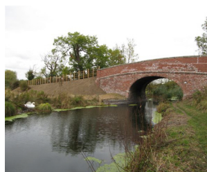
Stenwith Bridge looking good once again