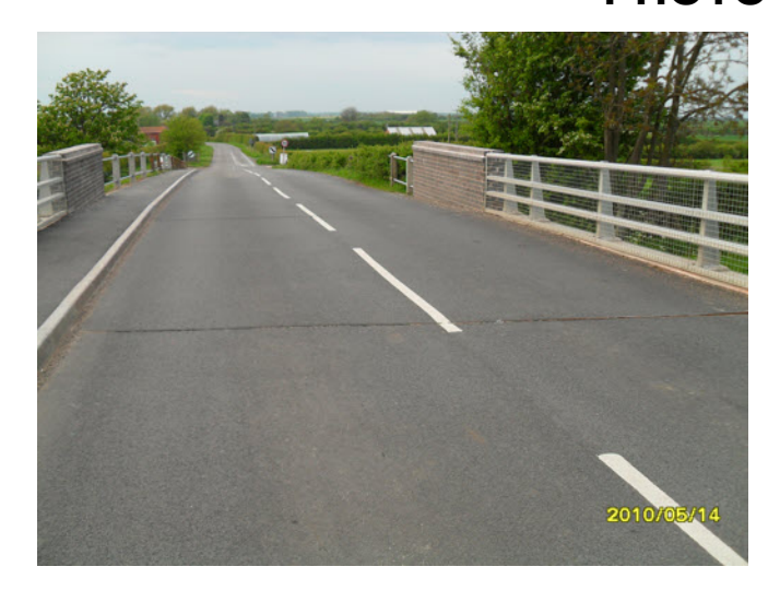
Pictures (right & below) taken at various locations on the Grantham Canal.