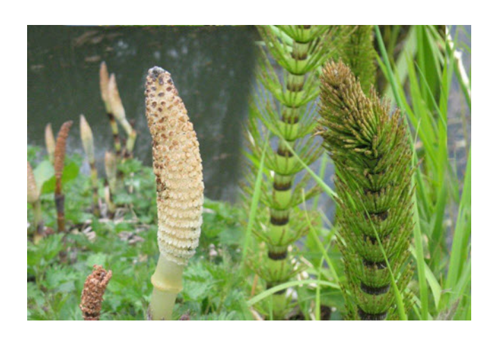
(Above) The cleverly merged picture from David is of water horsetail as seen in April and (on the right) a month later.