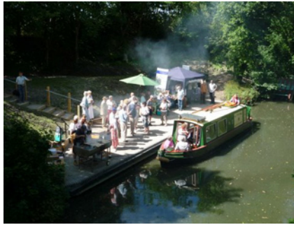
Safety instructions to passengers from the crew of The Three Shires.