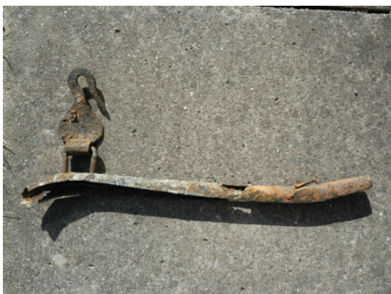
This was 'fished' out of the canal at Harlaxton before the Opening Ceremony. Anyone got any ideas what it is please?