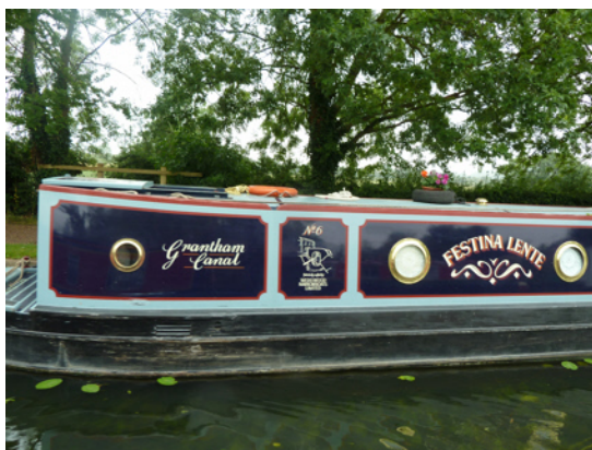
Finally, a scene from the Erewash Canal. Someone is obviously very proud of our Grantham Canal or hoping for a mooring!