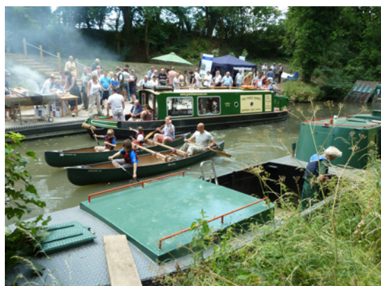
A bit of congestion here!