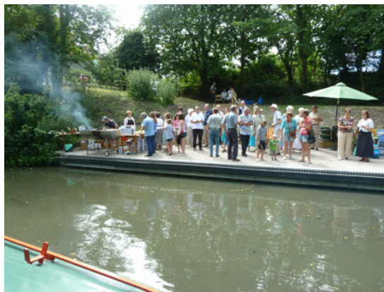
And this is only the queue for the BBQ.