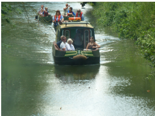
Are the canoes really getting a tow from the trip boat?