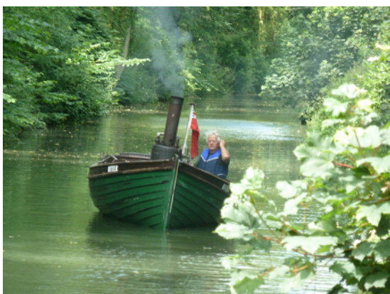
African Queen springs to mind!