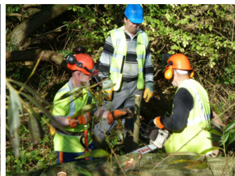
Time for a bit of discussion!