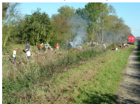
Bitm doing what they do best on a really beautiful October morning.

BITM were back with us at Mann's Bridge, Cotgrave for a working weekend, removing trees and undergrowth on 16th and 17th October. Removing some of the huge tree stumps took some extreme winching power whilst the advance guard, made up of six GCS members on the Saturday and four on the Sunday, ploughed into the rather lighter trees and branches that were overhanging the towpath. Two ladies from Bitm kept the bonfires going and we all felt very pleased with the progress made. Normally we have just one chainsaw on site but this time we had three so all the cut branches were of a manageable size. As most of us 'are getting on a bit' we needed the extra help! If you stand at Mann's Bridge you will see that we are nearly at the end of the long straight. The next stage becomes a bit soggy so we may have to think about using the aluminium boat. Sincere thanks to Tony, Barbara and the team for all their hard work and to Peter Gadd, for once again allowing us the use of his farm track as a car park.