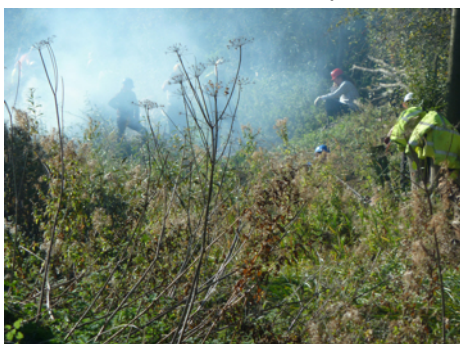
Everybody has to rest sometime!