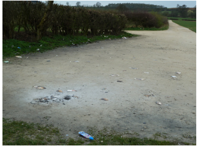
Who would need to burn a pile of papers at Denton Slipway first thing in the morning?