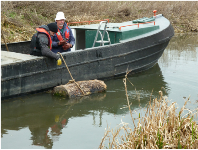
We caught this one before and it's heavy!