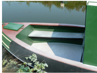
Extinguisher powder everywhere