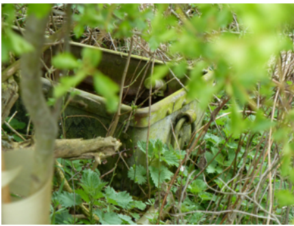
An old metal trough with handles at each end and fitted with a float valve, hiding just beside the towpath