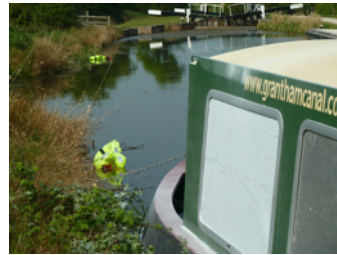
Buoyancy jackets activated