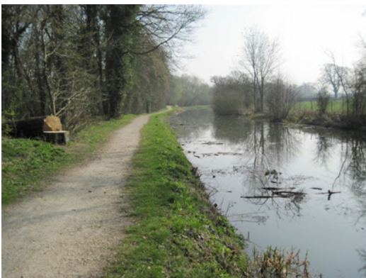
Left: Branches like this litter the whole 4 miles.