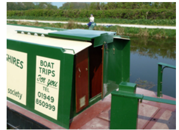
The sliding hatch force back

Our sincere thanks to everyone who took the trouble to phone in on both days, to report that something was wrong.