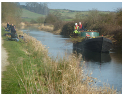
Gently past our friends, The Grantham Anglers and back to Woolsthorpe to unload.