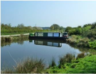
1st attack of 2011 - set adrift

Unfortunately the idiots have come out of hibernation once again! The boat was set adrift from its moorings on Saturday night /Sunday morning 16th/17th April and then broken into, early Monday morning. Fortunately once again the damage to the boat itself was minimal but the fire extinguisher was let off in the front well and the roof and one side were also covered in white powder from it. The spent extinguisher was thrown in the water, as was the life ring, the two self inflating buoyancy aids and the now broken donation box which was empty anyway! Repairs and replacements will amount to something like £200 + at least 2 days work for two volunteers to sort it out + the wages of FIVE, yes FIVE, police officers who responded to our plight. At least we cannot say that we don't get support. On the lighter side, those responsible for the break in removed some bin liners to take their booty away. This consisted of about 10 muffins, which they abandoned in the trees and the car park. (obviously our catering is not to their liking). Four water glasses and about 20 teaspoons which they also left. (perhaps they planned to weigh the spoons in at the local scrapyard).