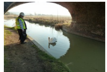
Dave Cross is good with swans as well as dogs!