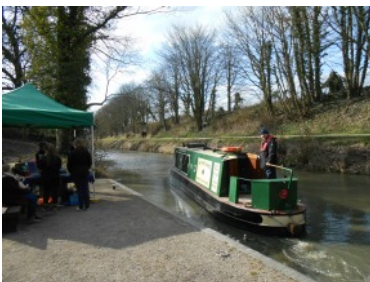
Another trip with a boat full of passengers

Text and photo (below left): Ralph Poore