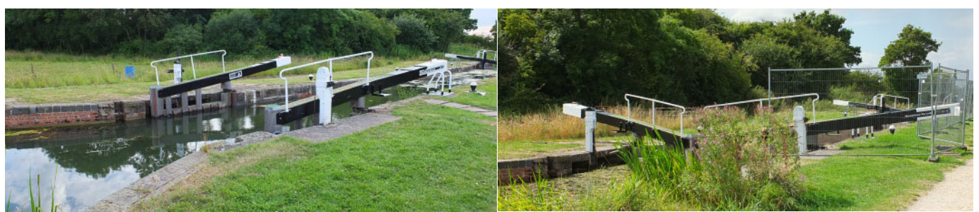
A well loved Lock 18 after WRG's splendid efforts in July