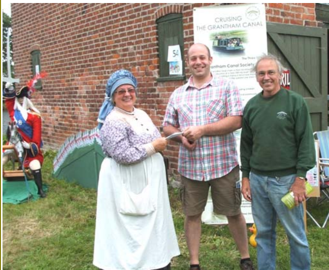
Cheque presentation at Hickling Scarecrow Festival.