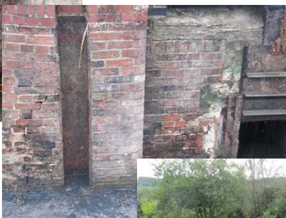
Mud on the walls - before & after cleaning

Further details will be available soon. CRT and GCS have agreed terms under which the GCS will lease Woolsthorpe Depot for the next fifteen years. This will