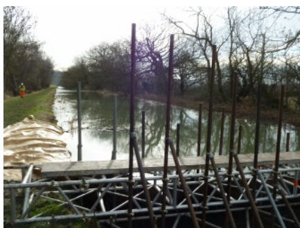
Photo (left) shows part of the 'Coffer Dam' mentioned last month. This type consists of a tubular metal frame which rests on both banks and a huge plastic sheet which is laid against it. The sheet, yellow in the picture (right), also covers the bank on each side of the canal. There are uprights to keep the whole structure in place but as can be seen, something that is relatively simple easily retains the half mile pound.

When things move, they move very quickly! The survey of locks 14 & 15 have been completed.