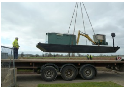
Mudlark gets loaded

By 15.30 we had secured the site and were on our way home. After the first hiccough everything went according to plan. Thanks to everybody who came along to help or watch.