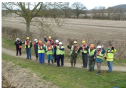
Must be the Grantham Canal supporters club