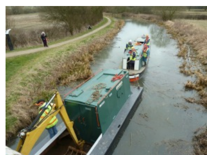
Mudlark under tow

During the past month we have been busy blacking, painting, repairing and servicing 3 Shires ready for the 2013 season. Unfortunately the weather has not been too kind to us and progress has been a little slow. However, except for the external painting, everything has been done and we are ready to go. Launch date should be 28 th March and we are ready for the first trips on Easter Monday