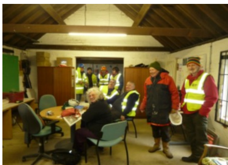
Waiting for the lorry. It's warmer in here!

Workparty members had been allowed some free time whilst the weather has not at its best but will have started again by the time you read this. We were out on the odd sunny day to complete the painting at lock 18 which was started by the Loughbrough students and on the 1 st March Mudlark was moved onto the water