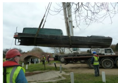
Out comes Centauri