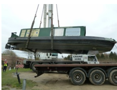
Not bad condition after 3 years in the water