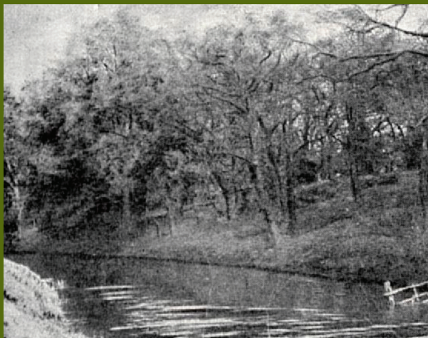
Harlaxton Cutting in the 1900's