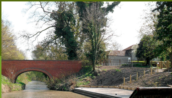
The Newly Restored Harlaxton Wharf

The boat has comfortable seating in the cabin for 10 people and space to enjoy the outdoors with seats for 2 people on the fore-deck. It is equipped with a small kitchen (everything is small on a narrowboat) and has a toilet for use in emergency.