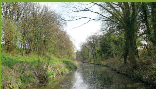
Dredged for Navigation: Woolsthorpe to A1, 2009