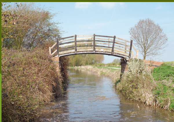
Casthorpe Bridle Bridge