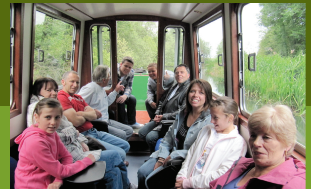
Seating for 12

The boat is not licensed for the sale of alcohol so why not Bring Your Own?