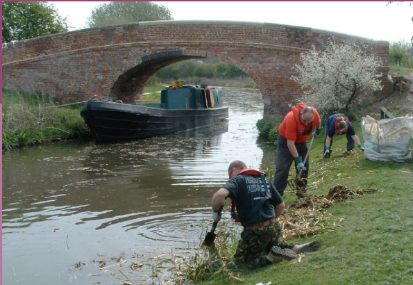
Workboat "Centauri" and the bank maintenance team

If you have the time, experience, imagination and commitment to help lead and manage this iconic project you are very welcome to join us.