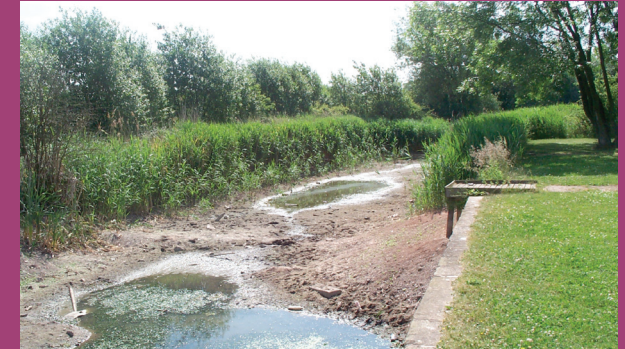
The Dry Section: Canal Bed Repairs Needed!

We operate charters for families, social groups, schools, office outings and birthday parties for a relaxing cruise through a beautiful stretch of the Lincolnshire countryside starting and finishing at the Woolsthorpe landing stage, just above Lock 18.