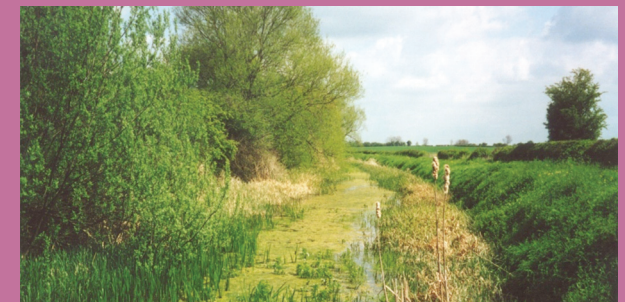
Weeds some attention...

If you walk the canal regularly join the GC Rangers. Help extend awareness and involvement within the community and visitors alike.