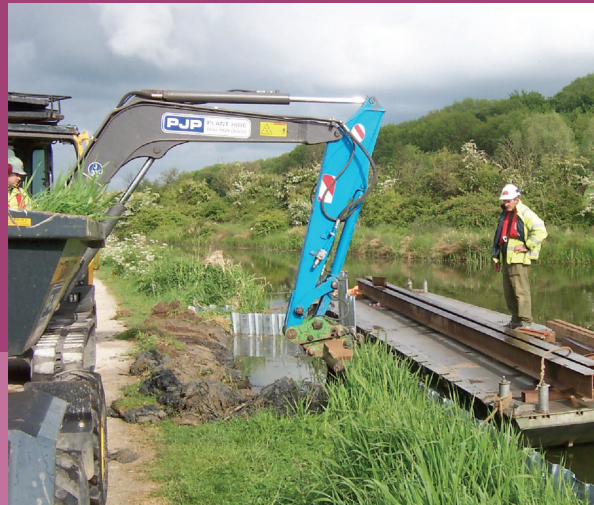
Constructing Woolsthorpe Wharf

Or provide material and help edit our monthly email newsletter “ Bridge ” and our twice yearly newspaper “ The Grantham Canal News ”.