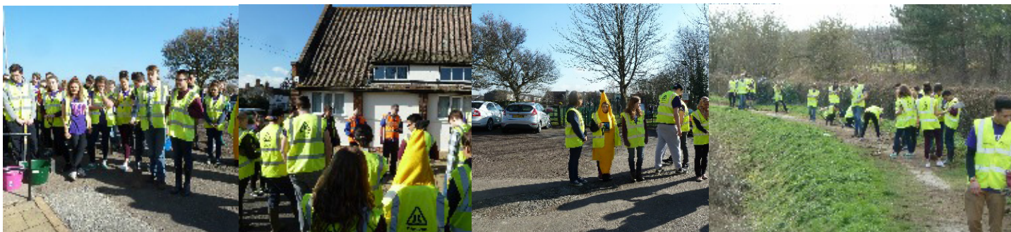
Students from Loughborough at Cropwell Bishop

Since August our workparties have clocked up 2120 hours on the Canal