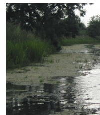
The Three Shires struggles with silt & weeds