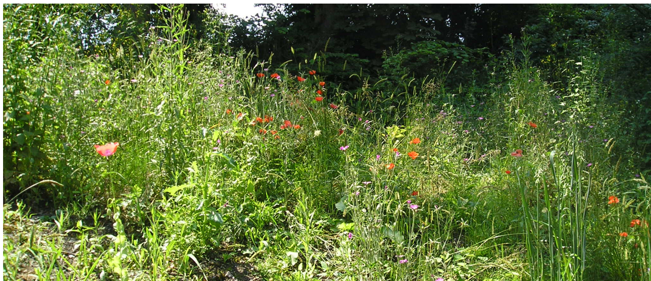
Wildflowers at Harlaxton Wharf at the beginning of July as a result of managed seeding, natural seeding and a bit of guerrilla gardening by a few well meaning folks.