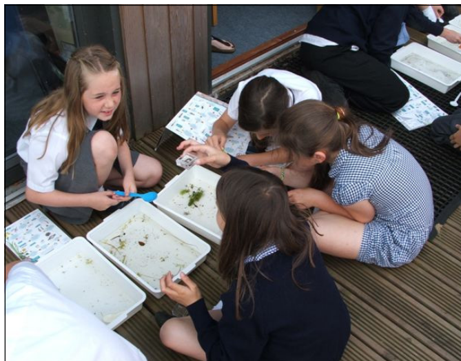
Kinoulton School children comparing samples taken from Harlaxton Wharf (left) with samples obtained from the canal at Kinoulton (right)