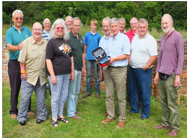
Representatives from Melton Sailing Club together with some of The Grantham Canal Society's volunteers