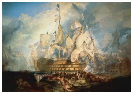
Painting by William Turner