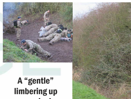
A "gentle" limbering up exercise!

Our thanks to the Cranwell RAF Cadets who worked hard at the Cropwell Bishop dry section. They cleared scrub right through to the Kinoulton Road bridge