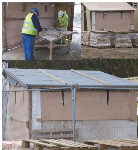
Our grateful thanks to John Clark, Dave Cross & Bob Taylor for all the details & numerous photos

Substantial progress has been made at the lock by our volunteers. They have toiled relentlessly and cleared the base of the lock chamber from sludge which had built up over the years to over 3ft in depth. The invert has now been fully exposed and looks in good shape having been protected by the sludge from the ravages of bad weather. In their "spare" time our workforce have also built a lean-to in order to protect the brick cleaners from the wind & rain whilst carrying out this monotonous task. Next job - further demolition! Which no doubt will result in a pile more bricks to be cleaned!