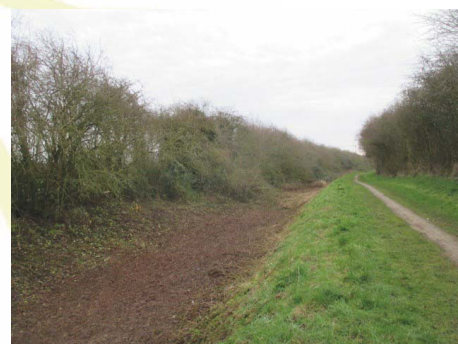
The finished result - brilliant!