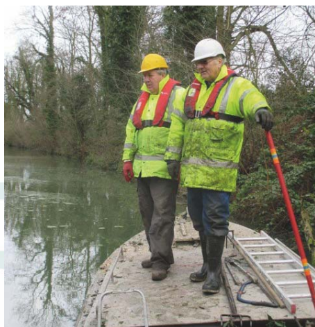
A job well done - especially when you see the pile of debris & logs they have pulled out of the canal.