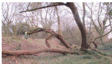
A GCS Volunteers Coat Hanger We build em big!

A BIG THANK YOU TO ALL OUR CONTRIBUTORS FOR YOUR ARTICLES AND NUMEROUS PHOTOS Closing date 9th, every month!