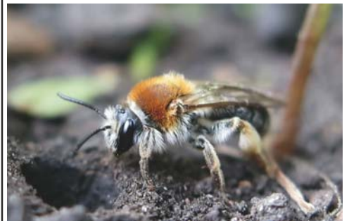
Early Mining Bee next to its nest burrow.

There are at least 15-20 species of Mining Bee which can be found around Leicestershire, and many more across the UK as a whole. Some are quite large and similar in appearance to the honey bee, whilst others are much smaller and are easily overlooked. Some species are quite distinctive, such as the Ashy Mining Bee with its ruffed grey-white collar, or the fox-red Tawny Mining Bee, whilst others are difficult to identify to species level without a microscope.