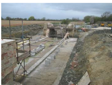
The first course of blocks laid.