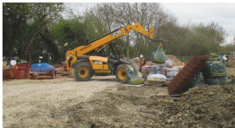
Another new skill acquired