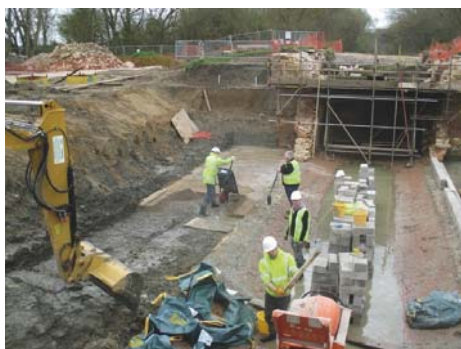
Laying one of the screed bases