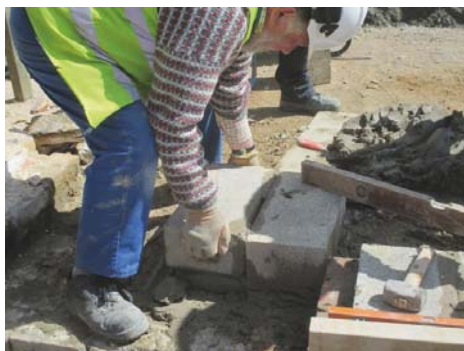
A new speciality - blockwork!