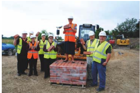
The launch

The Buy a Brick Campaign has made a good start with a successful Tombola which took place on Saturday 6th August.