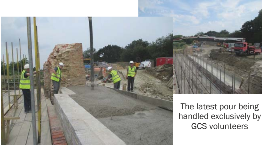
The latest pour being handled exclusively by GCS volunteers

Work continues at Lock 15 - Woolsthorpe Middle Lock thanks to our hard working band of volunteers and 4 weeks of WRG volunteers