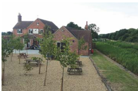
The recently re-opened Dirty Duck at Woolsthorpe by Belvoir

When it's sunny and warm, there's no better place to be than by water, and here in the Vale we are lucky to have miles of canal, surrounded by beautiful unspoilt countryside, to enjoy. A big plus of course is having somewhere to stop off along the way for a well-earned drink and a bite to eat. So I was pleased to see that the Dirty Duck at Woolsthorpe is now open again, giving us an alternative pit stop to the excellent Dove Cottage Tea Room and Plough at Hickling.