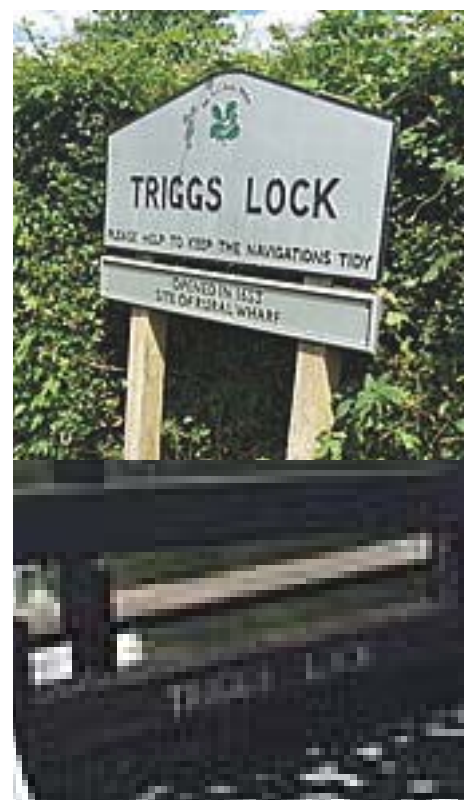
Something we didn't know?