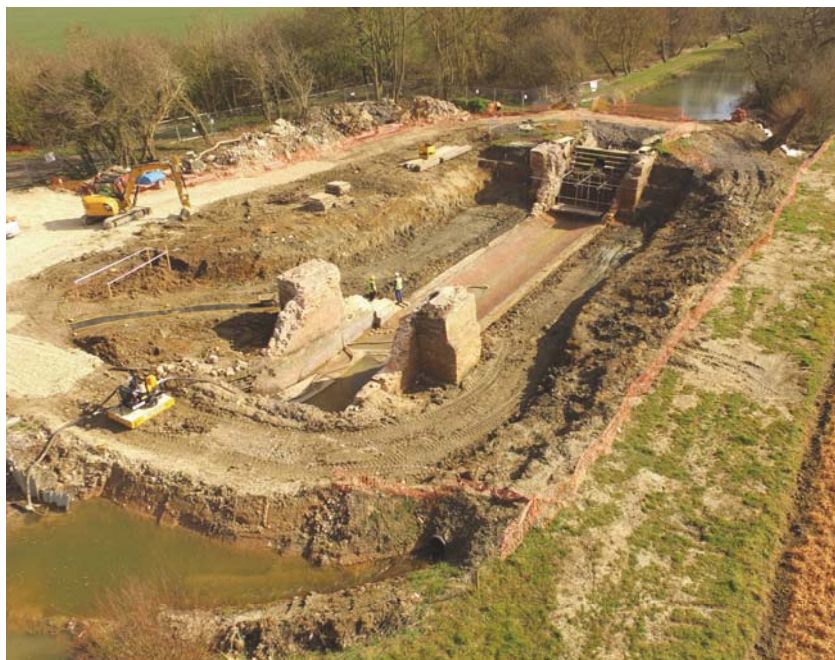
A fabulous overhead photo of Woolsthorpe Middle Lock showing the lock totally reduced down to the invert with only the 4 quoins standing.