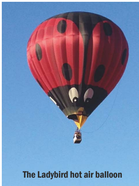
The Ladybird hot air balloon

some time for the right conditions if your flight is postponed.