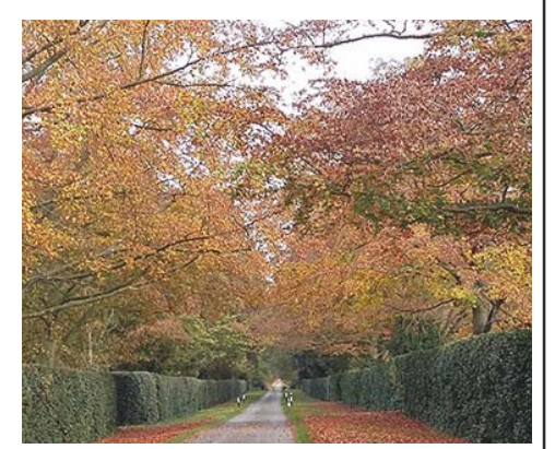
A 'roof' of autumn colour on a road near Whatton in the Vale

First up is the Community Christmas Lights event on Friday 25 November from 3.00pm to 5.30pm at the Cotgrave Shopping Centre. Local organisations and businesses will be setting up stalls there for the afternoon. Then on Saturday 26 November the Christmas lights will be switched on in West Bridgford town centre. Seasonal festivities throughout the day will include street entertainment. fairground rides and ice skating plus there'll be a variety of food and gift stalls. The big switch on will be at 5.00pm followed by a firework finale. At the other end of the canal, Grantham will be putting on 'Christmas on the Green, including Christmas Lights Switch On' on Sunday 27 November between 10.00am and 4.30pm. Again, lots to keep you entertained including stalls, fairground rides, Santa's grotto and refreshments.