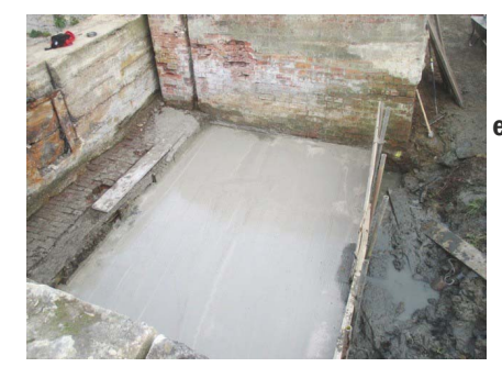
Grateful thanks to John Clark and Dave Cross for these photos and update info.

Access cut down to the upstream wing wall to enable a concrete floor (shown left) to be poured for work to proceed on re-pointing and cutting in new stop board recess