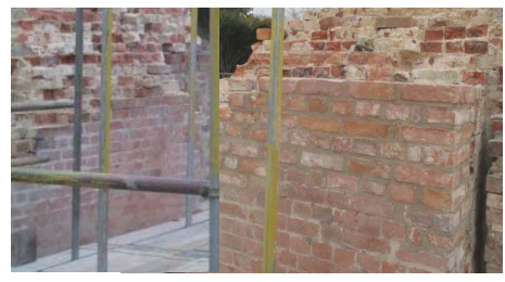
CRT Trainees rebuild part of the corner post using reclaimed bricks and lime mortar

Access cut down to the upstream wing wall to enable a concrete floor (shown left) to be poured for work to proceed on re-pointing and cutting in new stop board recess