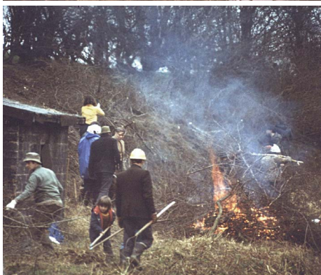
Scrub bashing at Bottesford Cutting & Wharf during 1970's