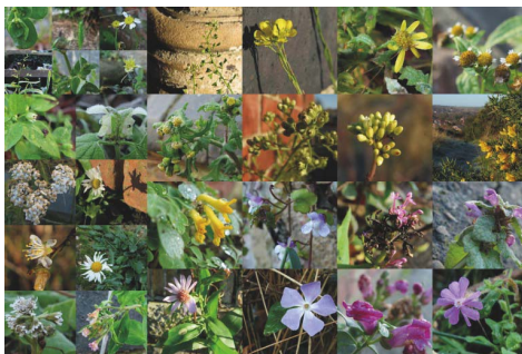
This is a collage of 30 species found flowering around Grantham on 2nd January

Then there are those species which require a very close look to even realise they are flowering – the petty spurge for example has tiny little green flowers within its leaves which don't draw much attention to themselves, but are certainly apparent to their pollinators! Keep a keen eye and see what you can spot, and why not get involved next year? Search 'BSBI New Year Plant Hunt' for more information!