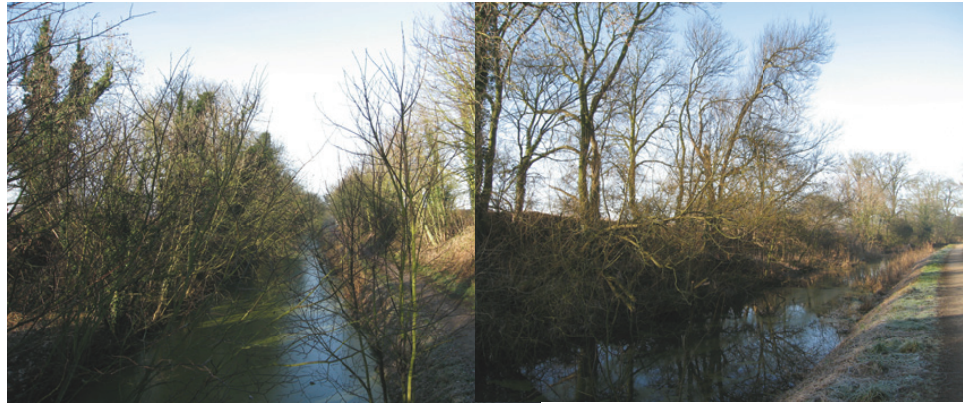
Harlaxton Cutting prior to the arrival of the volunteers