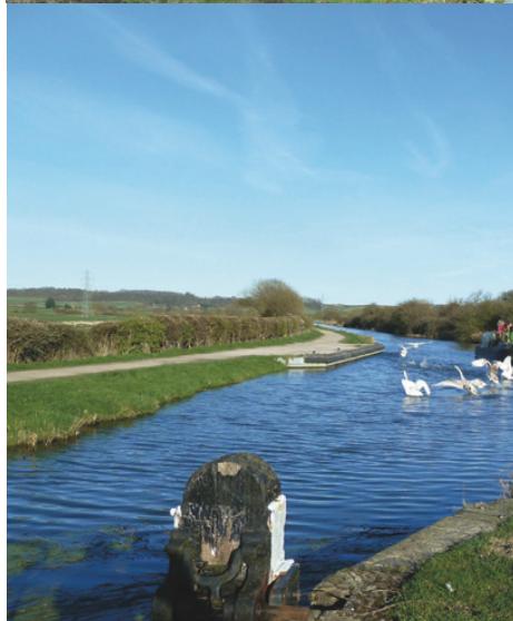
Workparty return Lock 18