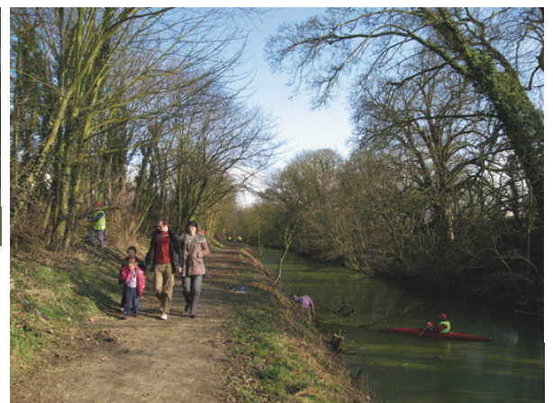
The future generations we're doing it all for.