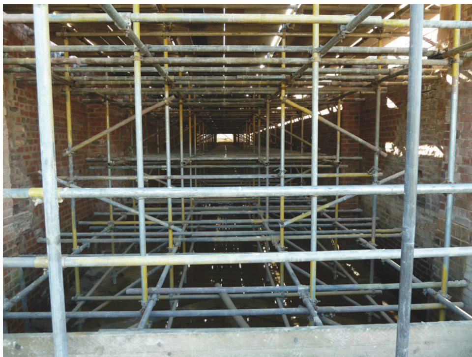
The labyrinth of scaffolding inside lock 15