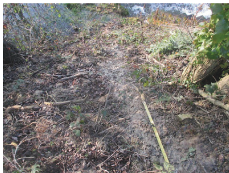
Mink tracks near lock 15

If successful it may be possible to develop proposals to alleviate the problem if significant numbers are found.