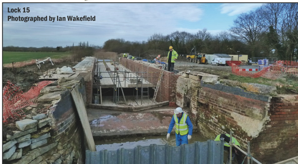
Lock 15