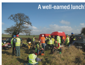
A well-earned lunch!