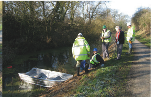
The "official" launch of the GCS's new aluminium workboat