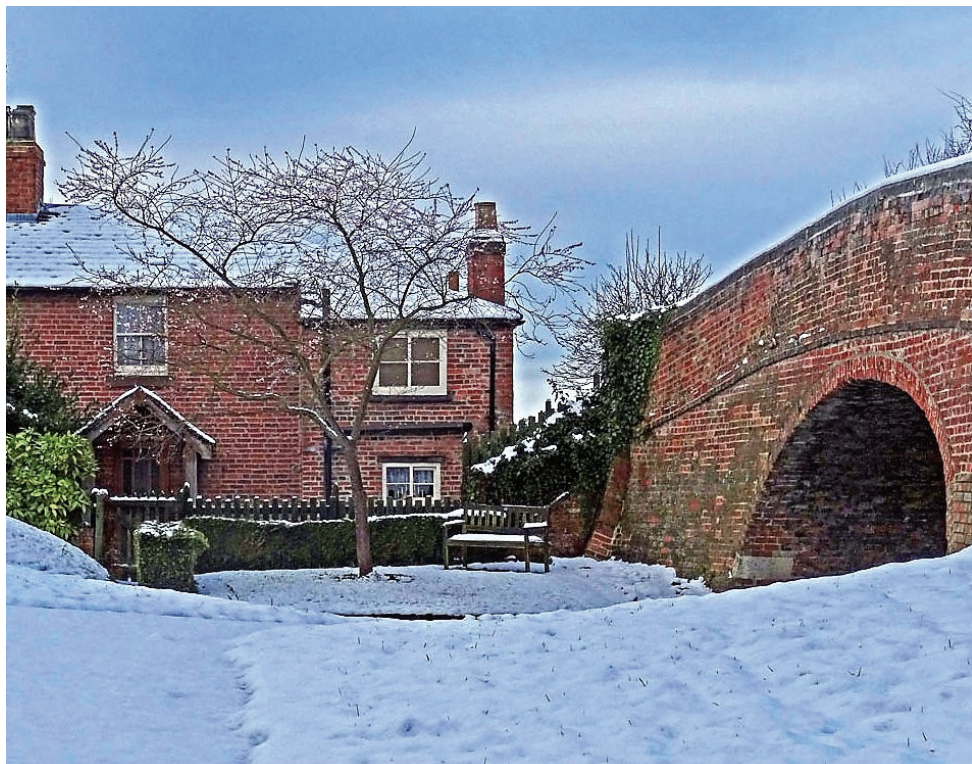
Keeper's Cottage at Willis's Lock

The Grantham Canal Society CHARITY NO: 507337