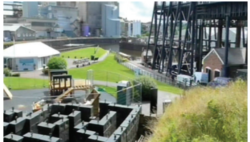
The maze under construction for the children's play area, made out of the old counterweights

Stage 3, 8 days from Kings Bromley to Anderton went according to plan and was much less hectic than my earlier mad dash. From Anderton Marina I planned the longest stage, hoping to cruise the Huddersfield and Rochdale canals and connecting links. I say hoping to cruise them, as it didn't quite work out as planned.