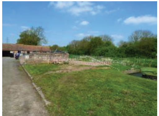
The location of the slipway at the Depot