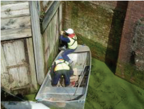
Two Tony's sealing L16 lower gates with oakum