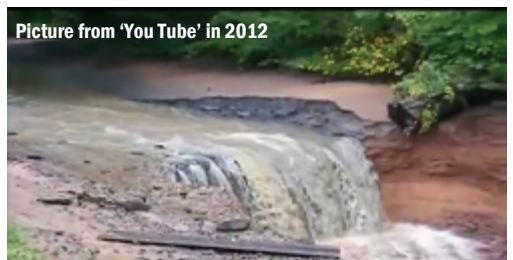
Picture from 'You Tube' in 2012

My first cruising day from Anderton was lock free, and the second day only involved a very shallow stop lock at Dutton before joining the Bridgewater canal. Dutton Lock is at the point where the canal was breached in September 2012.