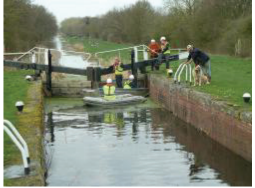
Time for a chat!