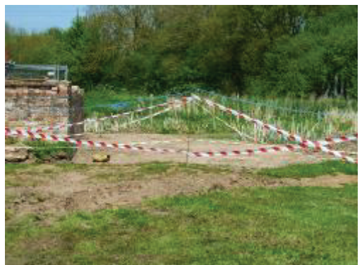
Preparation work has already started