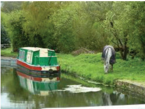
Cutting the grass whilst waiting for a boat trip!