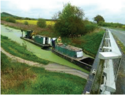
Workparty returning to Woolsthorpe with Mudlark in tow