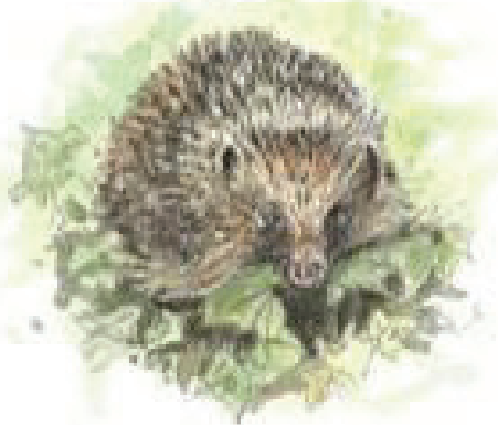
Hedgehog drawing by Sally Smith

We are hoping to release at least 10 of our over wintering hedgehogs. Once they are out of hibernation it is very important to make sure they are released quickly once they have been checked over, as we find that they get very stressed. I have heard from other carers that they have had hedgehogs die of stress in their cages if they are not released as soon as they are out of hibernation.