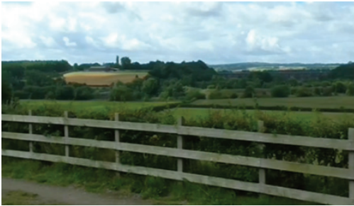
Open view from Breach Mooring on Trent & Mersey Canal near Dutton.

ideal mooring spot with views over the Weaver valley.