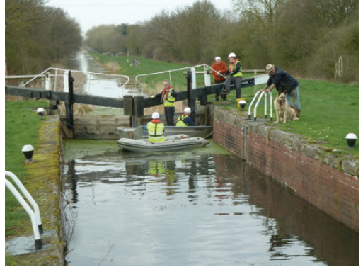
Time for a chat!