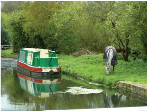
Cutting the grass whilst waiting for a boat trip!