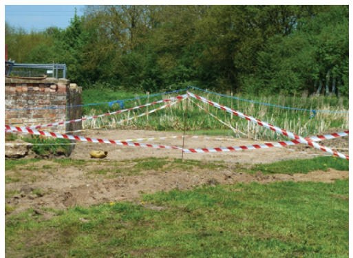
Preparation work has already started