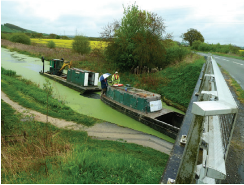
Workparty returning to Woolsthorpe with Mudlark in tow