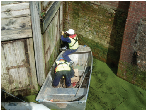
Two Tony's sealing L16 lower gates with oakum