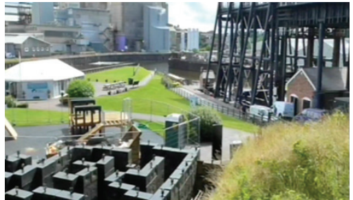
The maze under construction for the children's play area, made out of the old counter weights

Stage 3, 8 days from Kings Bromley to Anderton went according to plan and was much less hectic than my earlier mad dash. From Anderton Marina I planned the longest stage, hoping to cruise the Huddersfield and Rochdale canals and connecting links. I say hoping to cruise them, as it didn't quite work out as planned.