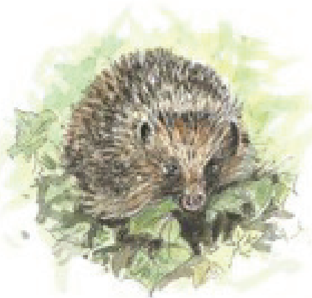
Hedgehog drawing by Sally Smith

We are hoping to release at least 10 of our over wintering hedgehogs. Once they are out of hibernation it is very important to make sure they are released quickly once they have been checked over, as we find that they get very stressed. I have heard from other carers that they have had hedgehogs die of stress in their cages if they are not released as soon as they are out of hibernation.