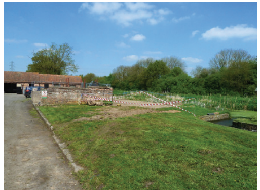
The location of the slipway at the Depot