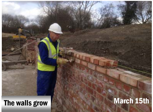
The walls grow