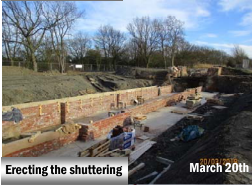
Erecting the shuttering