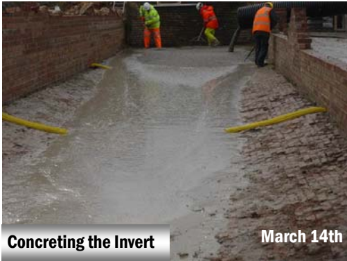
Concreting the Invert