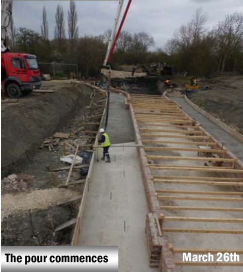
The pour commences