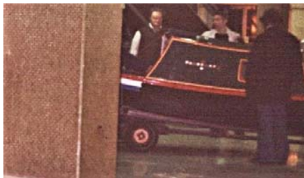
Top picture: Baby Grumplin pictured on the front cover of May's edition of Bridge in 1973.