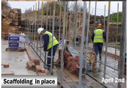
Scaffolding in place