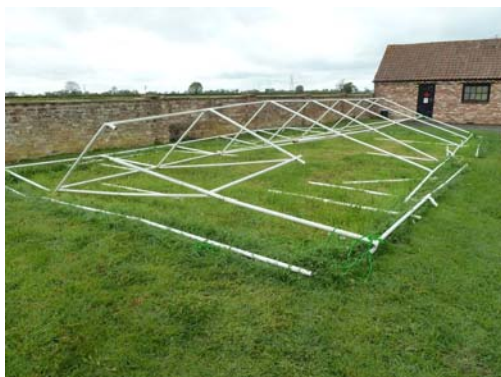
Storm HANNAH makes short work of our marquee