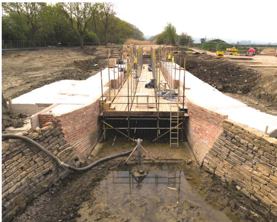
Aerial photograph of Kingston's Lock (14)

The Grantham Canal Society CHARITY NO: 507337