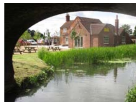
The Dirty Duck at Woolsthorpe

it met CAMRA'S approval, if so we would list the facilities on offer, try some of their beers and chat to the landlords to ask if they would like to be included in the guide. Our canal doesn't pass through the centre of many villages and the Dirty Duck is about the only one you could say was canalside, the Plough at Hickling a close second so most pubs on route vary considerably with regard to distance of travel from the canal towpath.