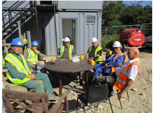
Our teams of volunteers are amazing!