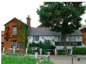
The Plough at Hickling

The basic idea was to look at OS maps and our canal guide to find all the pubs, within easy reach of the canal towpath, starting from Lock 1, Nottingham, through to Wharf Road, Grantham and visit each one to see if