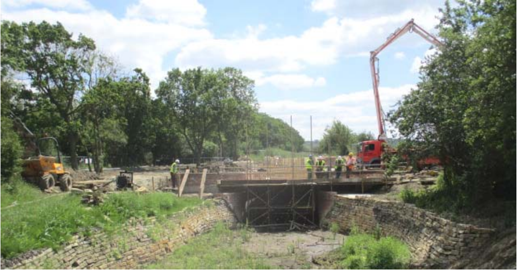
Yet another concrete pour takes place