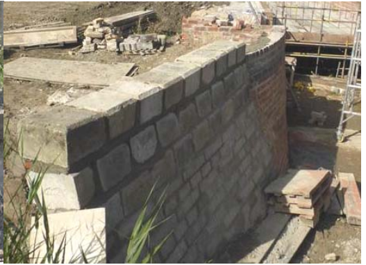
Richard and Rod adding coping stones to offside wing wall 17th Sept