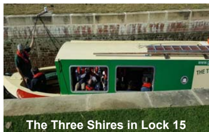
The Three Shires in Lock 15

The Three Shires played a key role in the Lock 15 Grand Opening event on 13 th October, taking the assembled dignitaries on short trips through the newly opened lock. The boat was out again on 14 th as part of Heritage Open Day, where we had a steady stream of 62 passengers joining us for our short trips. Visitors were asked to imagine what the canal would have been like in the days when barges were horse drawn and where the cargoes were mainly coal, agricultural produce and 'night soil'.