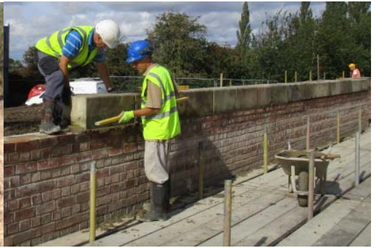
Coping stones for main chamber - ready for fitting 20th Sept & currently being completed.