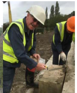
A "Master Brickie" at work!?