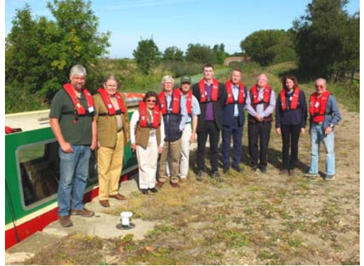
The assembled group of volunteers & dignitaries