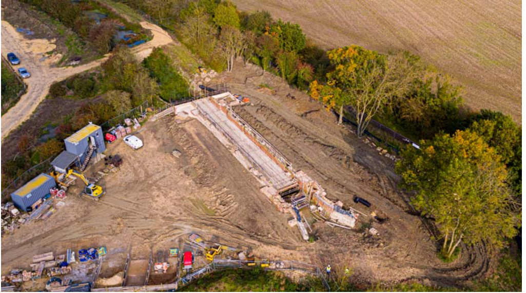
Lock 14 nears completion - Aerial photo from Sea Lane Media Ltd