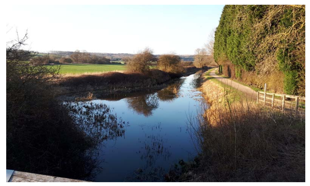
View from Irish Jack's Bridge (27) in the evening sun