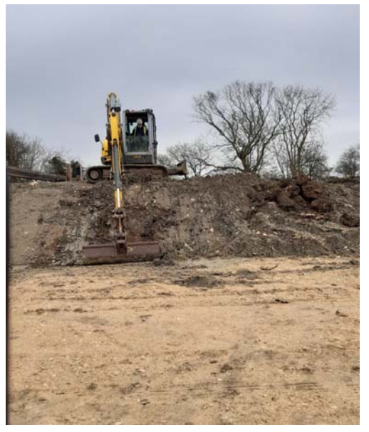
Landscaping 6 months later - but better late than never!