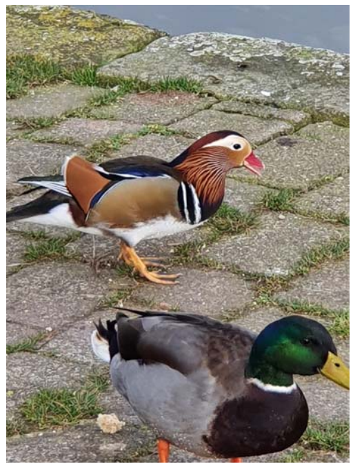
This photo of a Mandarin Duck was taken on the stretch of canal between Hickling Basin and Clarkes Bridge