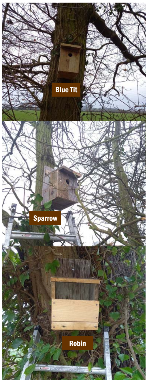
Phil Wright's Bird boxes have been installed downstream from the Depot