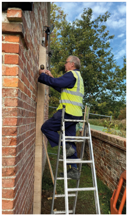
Above and left, work continues on the workshop at the depot (21 October)