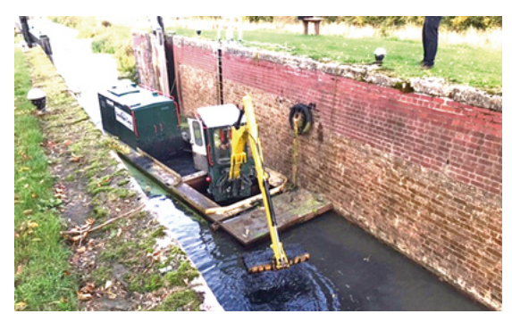
Mudlark on silt removal duties at Lock 16, 28 October

30 September: a lot of work done clearing grass etc and self sets around Lock 13 and opening access to the Sustrans route which will allow further surveying for future restoration.