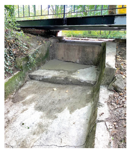
Job done! 16 Sept