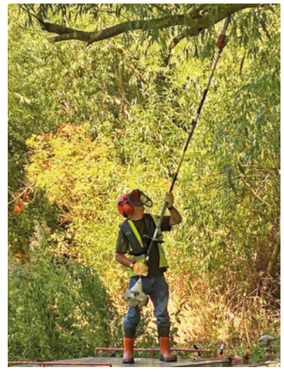
Pole sawing in the Amazon? (19 August)