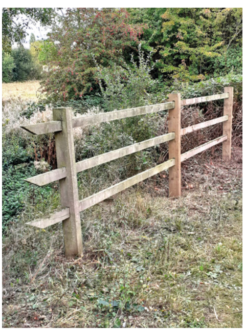
24 September: fence job at Irish Jacks bridge and Culvert 39. Above the culvert, 2 of 3 fence posts had rotted through. The fence protects an 8ft drop into the stream bed so the posts had to be replaced before the planned start of the culvert and leak works.