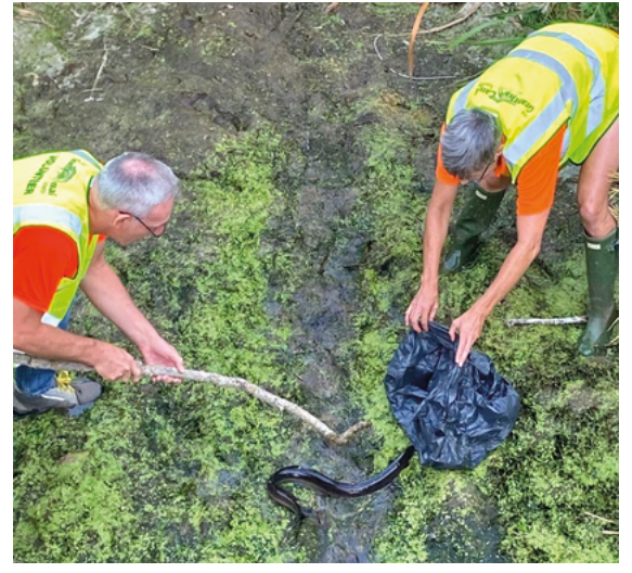
Eel rescue at a dry Lock No 2 on 13 August