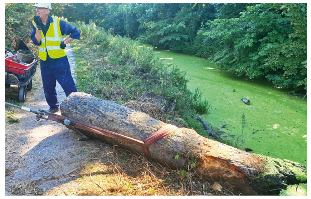
Tree trunk removed 5 August

A bunch of photographs from our unpaid volunteers working hard to maintain, refurbish and restore this wonderful canal, broadly covering the last three month's efforts. I could easily fill this entire magazine with their images. Ed