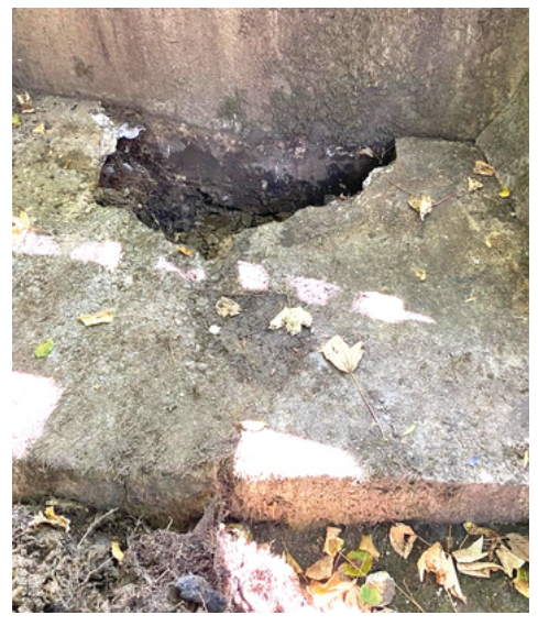
Hole to be filled