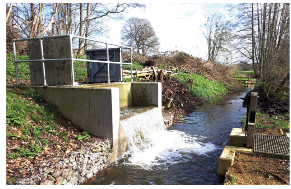
Clearance work on the Knipton feeder showing good results