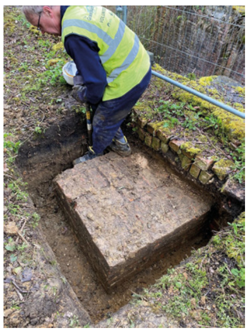
Digging commences at Lock 13 - with exposed buttresses seem to be connected to the lock wall ...

Vegetation clearance has been carried out on Locks 9,10 and 11 to enable CRT engineers to inspect and a further canal bank leak has been dealt with at Culvert 39 in Kinoulton. Work in Lady Bay and the Environment Agency has temporarily halted as we are in the bird nesting season so vegetation clearance is on hold.