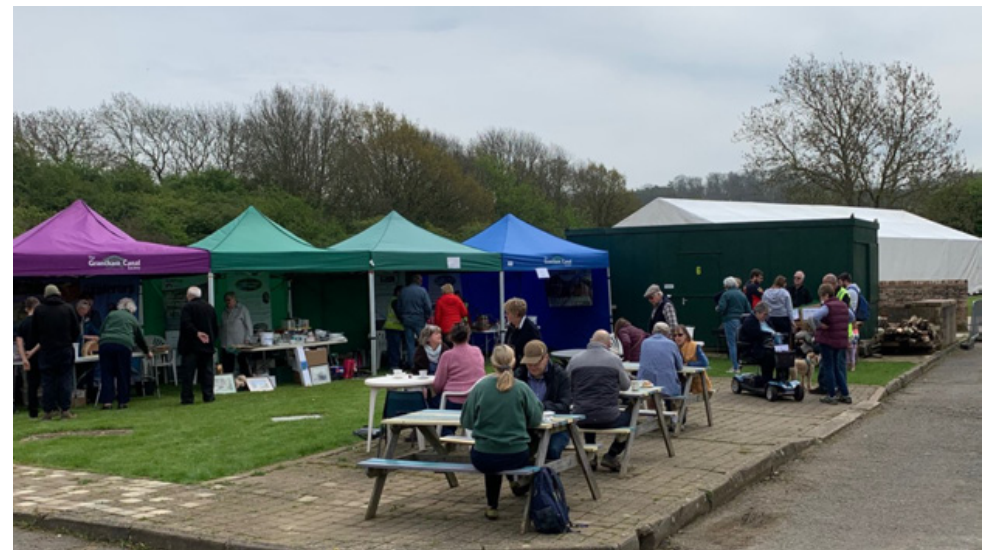
Open Day at the very tidy-looking Woolsthorpe Depot on 1 May

The Construction Team have now installed a pair of doors in the Workshop to enable larger machinery to enter for maintenance and the mezzanine floor has been extended to cover the whole area creating extra storage space. The electrics are being upgraded in the workshop and the Depot area is now taking shape as a marketing area.