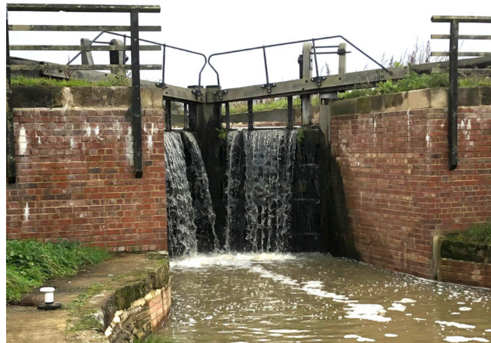
A couple of photos showing the increased water levels recently.

The Trustees' and the Independent Examiner's Reports and the Accounts (Financial Statements) will be available for inspection prior to the AGM, on application to the Acting Company Secretary.