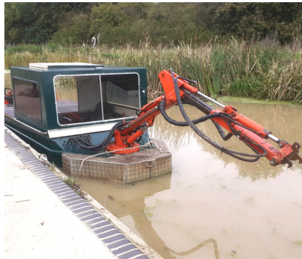
Refurbished Otter back on the water!

Finally, a Broadband connection into the Depot? Discussions with BT Open Reach are on going as is the availability of obtaining a modem to locally get a Broadband connection. A case of watching this space with our GCS Team on the case.